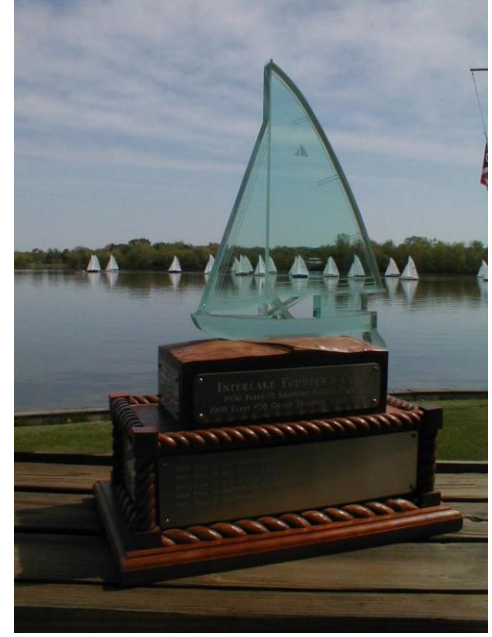
The ISCA Founder's Cup

the Founder's Cup shall be awarded based on the results of the 1<sup>st</sup> day. The Founder's Cup is to be awarded at the end of the first day of that races take place.