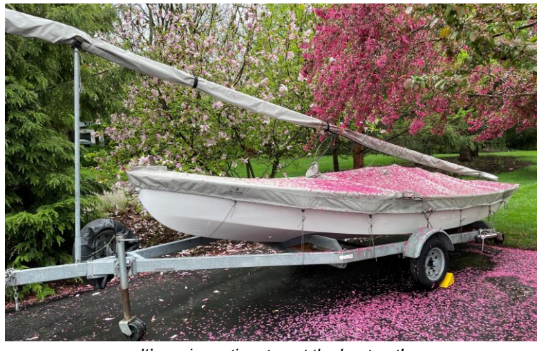
It's spring - time to get the boat out!

Looking forward to seeing everyone soon!