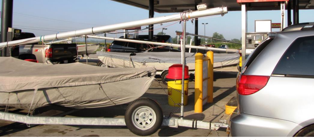
How many traveling Interlakes in this photo? Look closely!

Editors' Note – the full 2023 Travelers' Series schedule is published later in this issue.