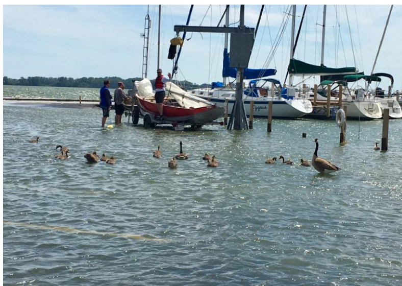
At the hoist at Sandusky in ankle-deep water.