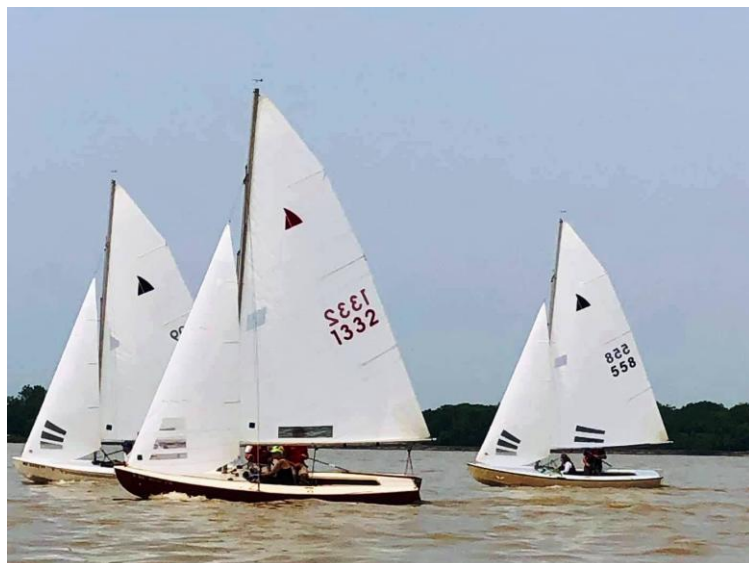
Cattail Regatta

After making some adjustments due to wind shifts, we got a second race started. The wind velocity had picked up to near 15 mph and the boats were making fast progress. The same four boats moved quickly to the lead. Race Two was looking very similar to Race