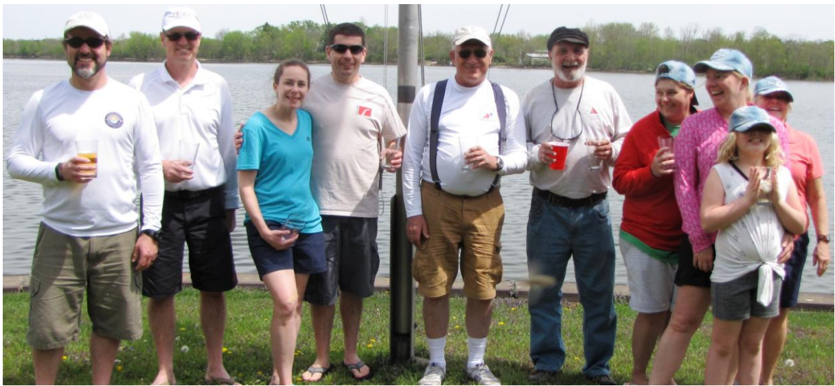
Winners at the Chief's Regatta