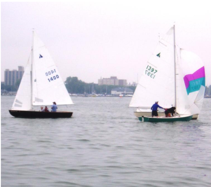
Sandusky One Design Regatta

I have known many multi-generational sailing families and am still amazed at what they bring to our sport. The next time you get the privilege to sail with or against one of these icons take time to listen carefully and see if you can figure out how they did it. Someone asked me the other day how long I have been sailing. I gave it some thought answered 50 years and immediately realized I am truly just a rookie and hopefully just getting started. See you on the Circuit.