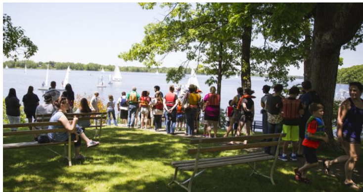
Photos in this article from the Open House at Hoover