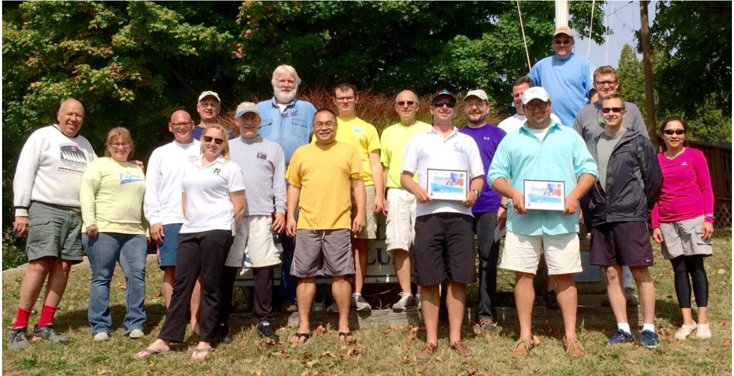
Poltergeist participants