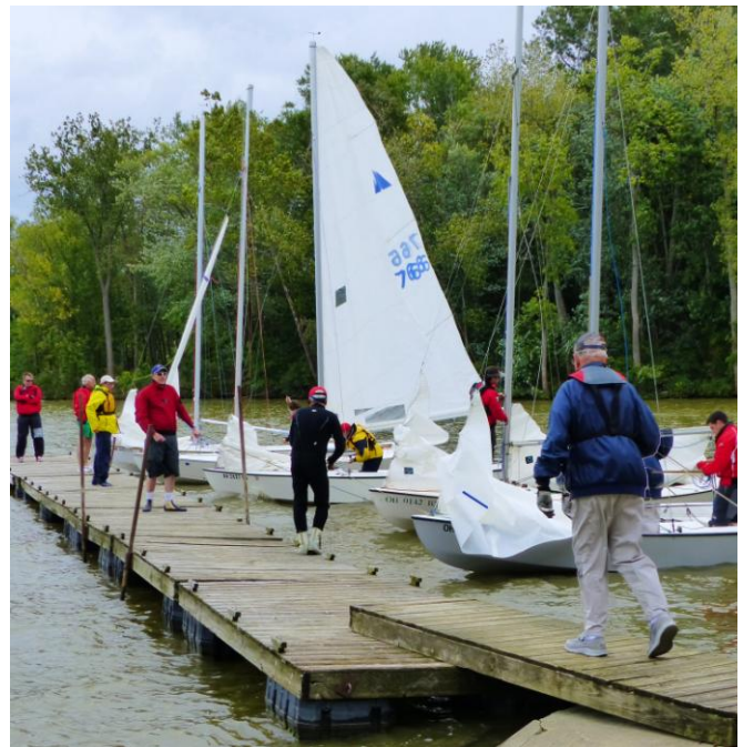
Getting ready to sail at Mohican

Centerboard – aluminum centerboard from an Interlake - I think it was a 1977. Shipping would be extra or I could arrange to deliver it within 250 miles from Houghton MI for a fee. Asking Price: $150.00 Contact Brian Waters at (906) 523-4798 or via email at bjwaters30@att.net