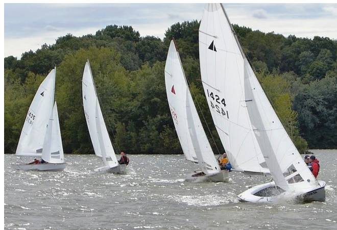
Action photos at the Haphazard

It was a grueling four-race series, and it was a tribute to the stable Interlake and to the talented skippers and crew that with 12 boats, 4 starts, there were but one Did Not Start, one Withdraw, and one capsized. Back at the clubhouse, the warm fireplace and the traditional grill-your-own-steak dinner rounded out a most successful event. Nothing haphazard about it.