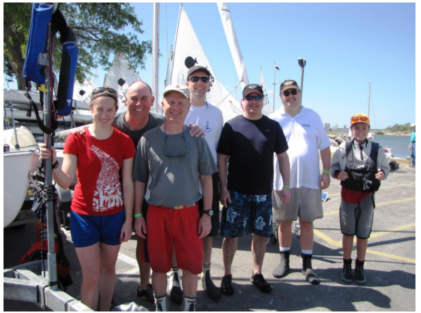
...a few more pics from Midwinters