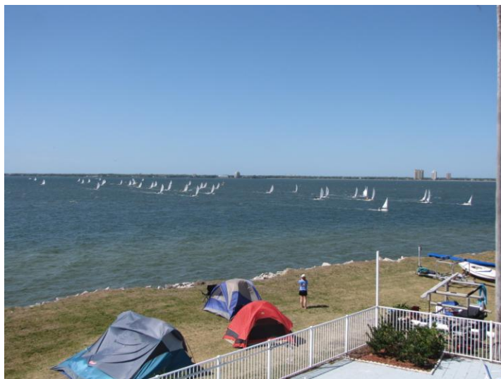
The Sunfish fleet heads in for the day.

Lastly, I encourage all of us to bring in new sailors to the class. Put them on board for club races and day sailing. Consider as well that the boats that are available can all be spruced up and fitted for competitive racing. They are good merchandise. Share your secrets to shorten the learning curve for the new people just as others have shared their secrets with you. Consider making the trip to Florida the next time we are invited. For all of these reasons I am very encouraged about where we can go as a class with the great people we have interested in doing the right thing.