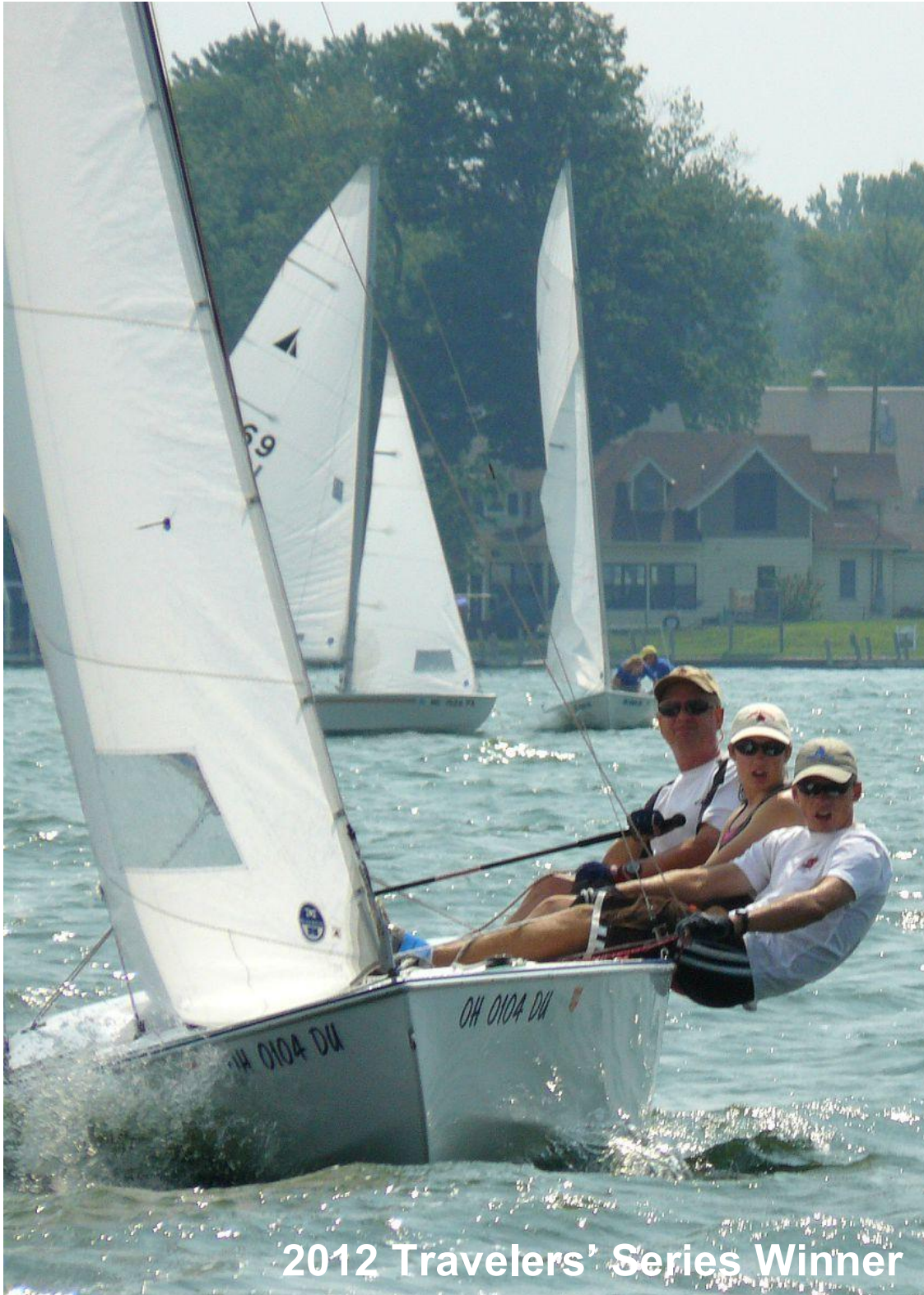
2012 Travelers' Series Winner