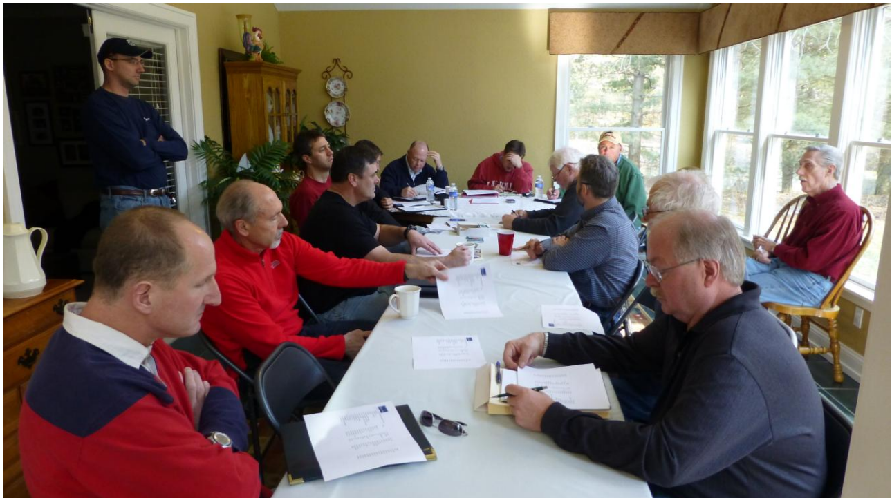
ISCA board members and fleet captains share ideas and information at the February meeting.