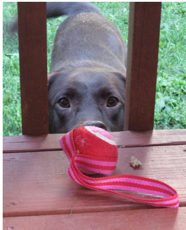
See what happens when you don't send photos from your events? Yep – another pic of our dog, Tyson.