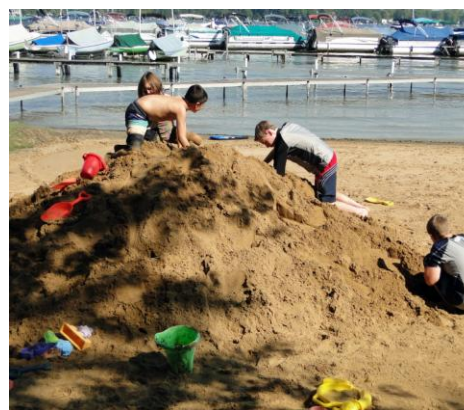
Hot to Trot