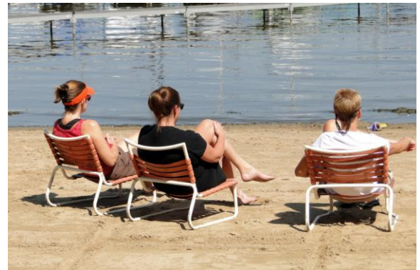
Waiting for wind...

A hearty thank you goes out to all those sailors who traveled to join us for the event; it is always a treat to have the company of so many sailboats on the lake . . . even when our guests outsail us on our home water. And warm thanks to all those at PYC who generously volunteered their time and talents to help facilitate the day's events.