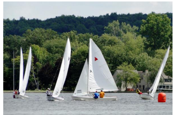
... and then it filled in