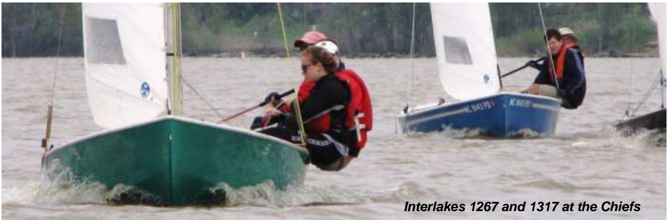
Interlakes 1267 and 1317 at the Chiefs